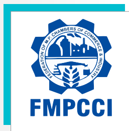
FMPCCI FEDERATION OF M.P. CHAMBER OF COMMERCE & INDUSTRIES