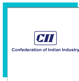
CII CONFEDERATION OF INDIAN INDUSTRIES