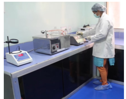
Quality Management System

Our team provides document support for registration of finished product for international market.